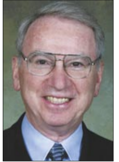
Irwin M. Jacobs